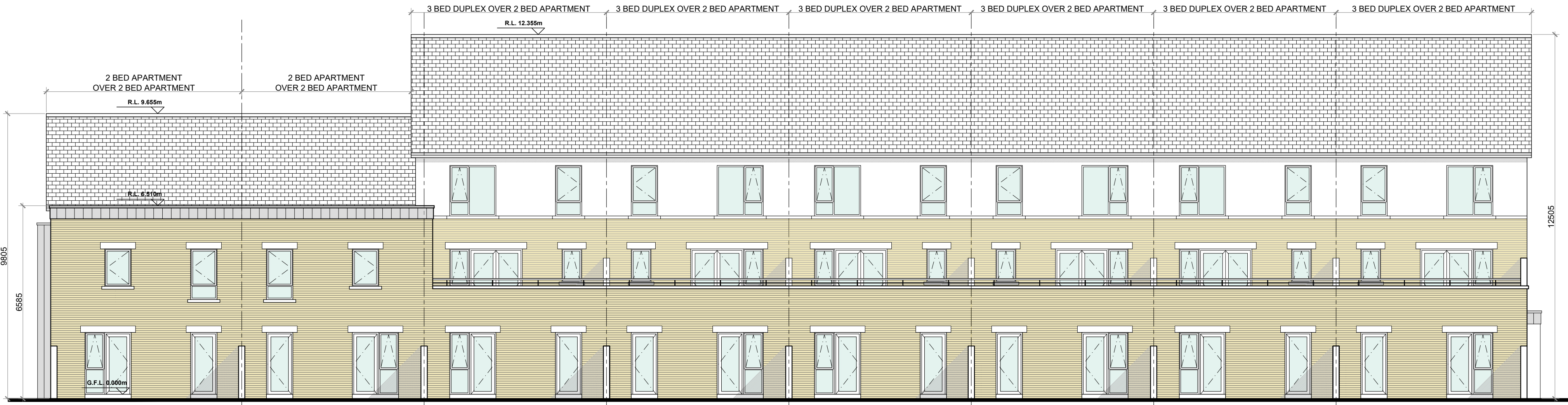
REAR ELEVATION @ 1:100 DUPLEX BLOCK TYPE 9