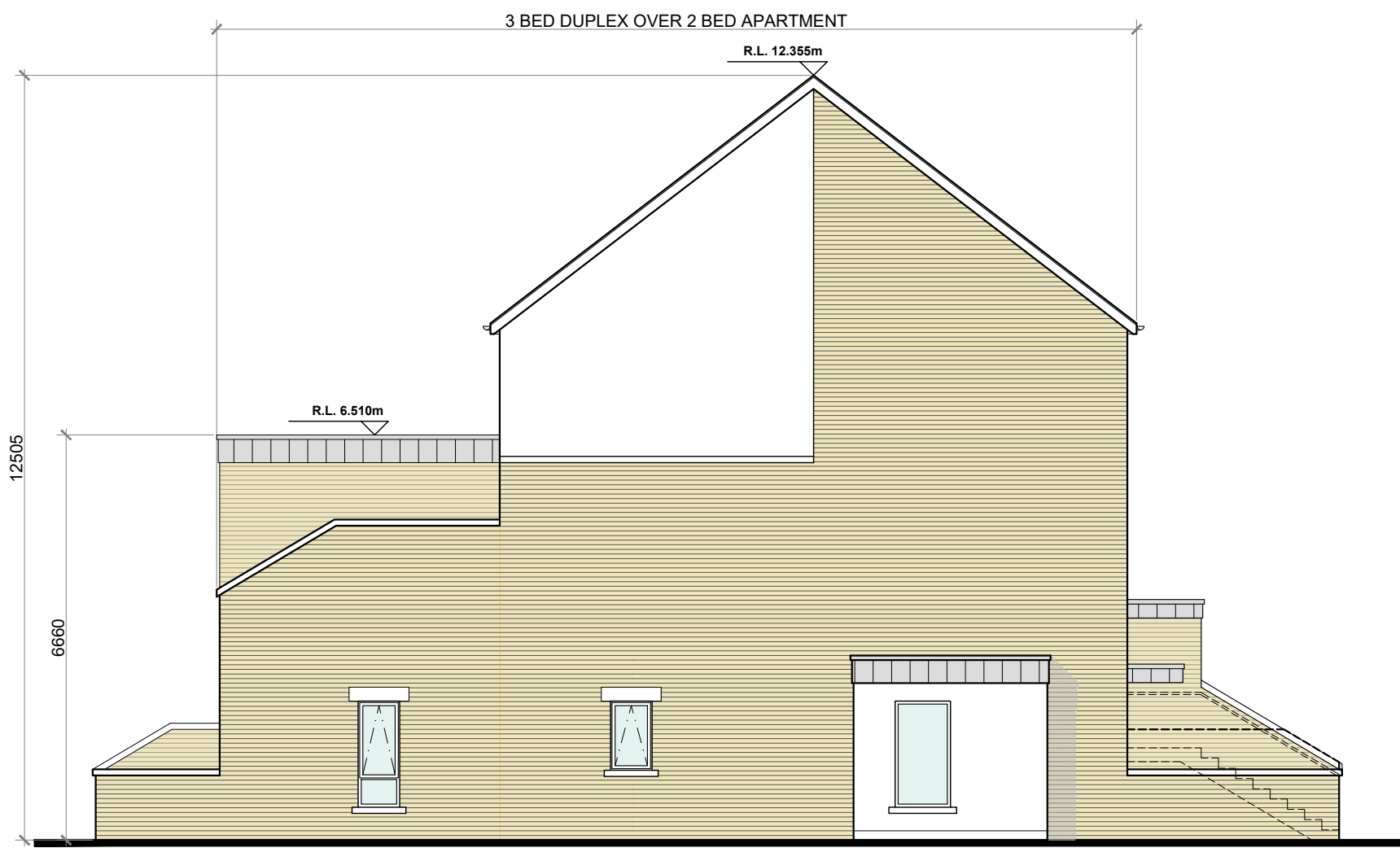
SIDE (DUAL FRONTAGE) ELEVATION @ 1:100 DUPLEX BLOCK TYPE 9