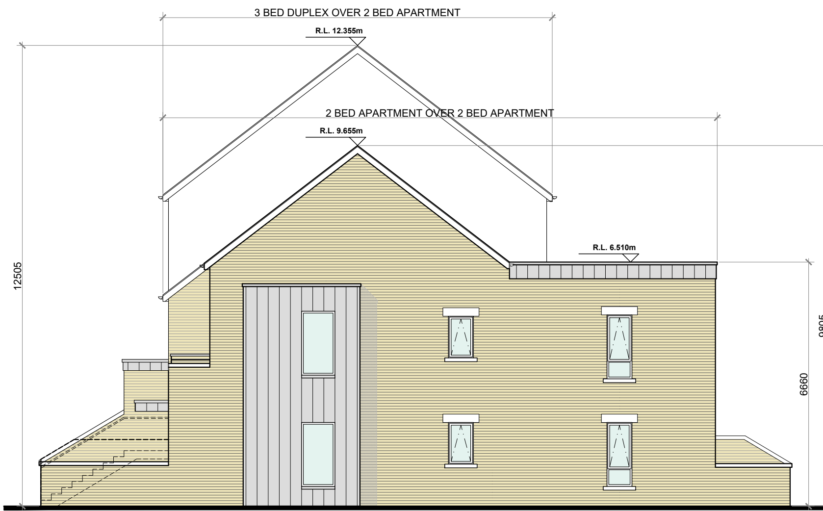
SIDE (DUAL FRONTAGE) ELEVATION @ 1:100 DUPLEX BLOCK TYPE 9