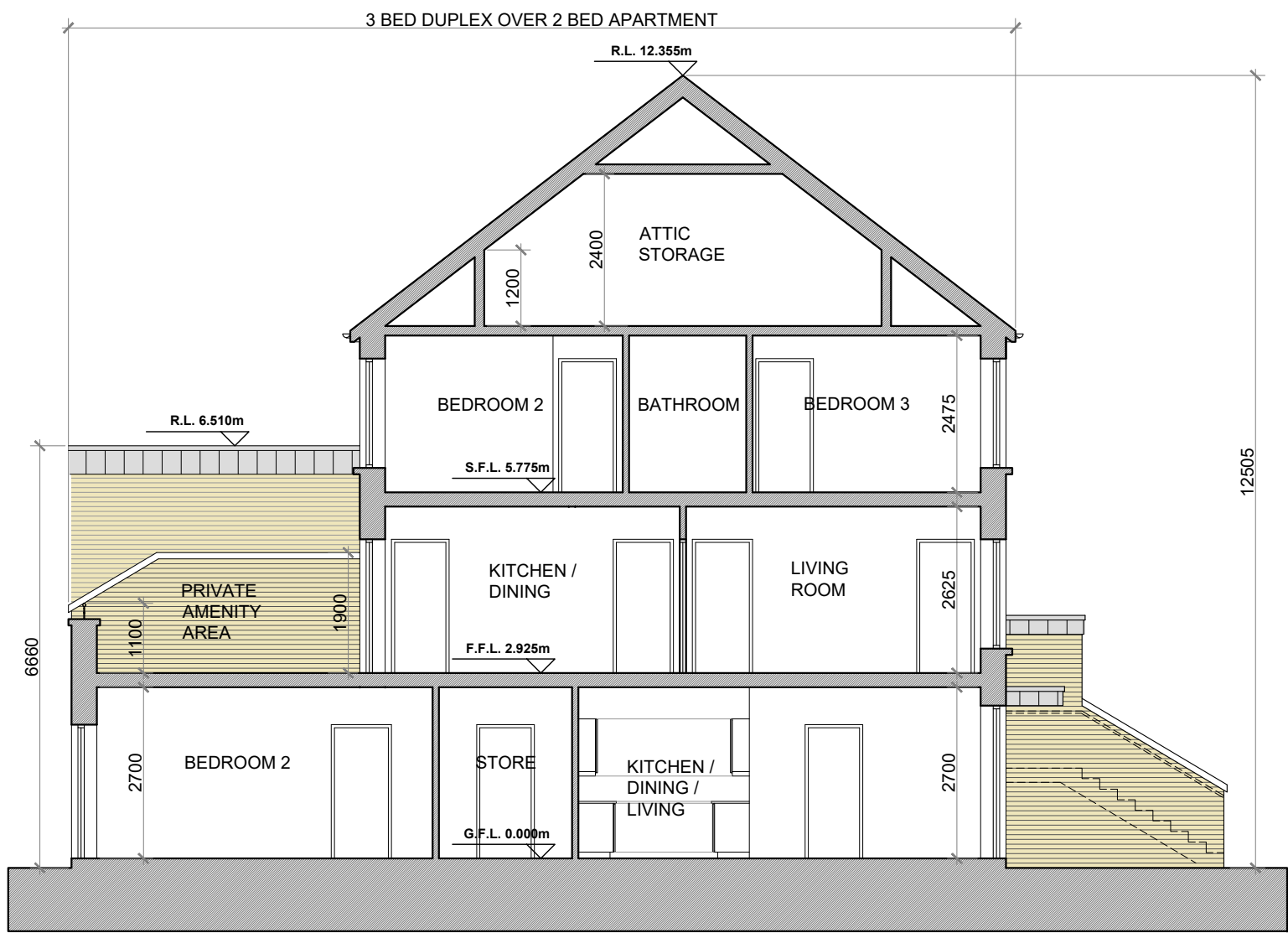
SECTION A-A @ 1:100 DUPLEX BLOCK TYPE 9