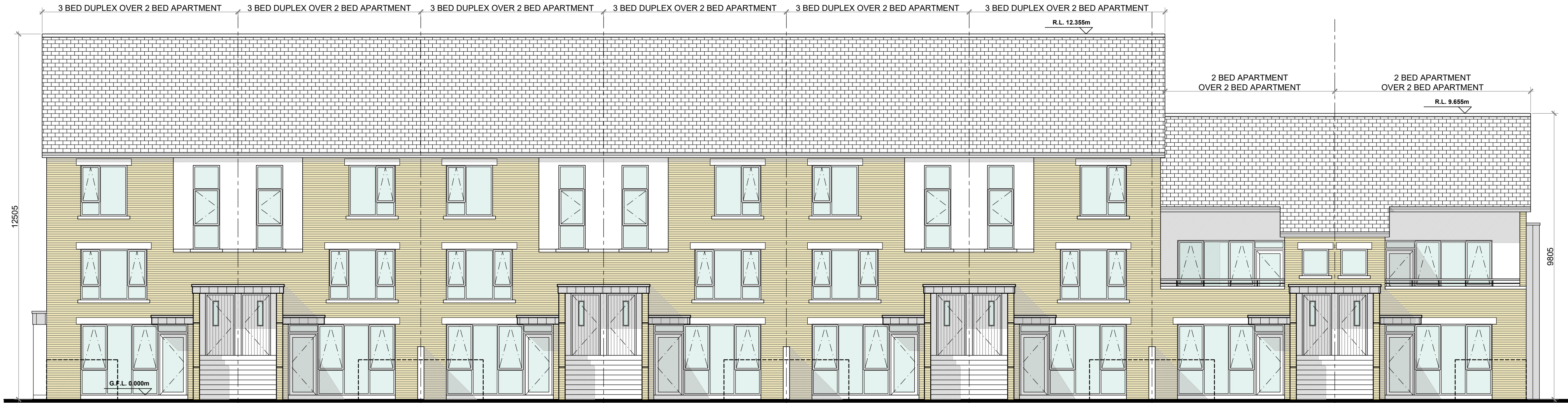
FRONT ELEVATION @ 1:100 DUPLEX BLOCK TYPE 9